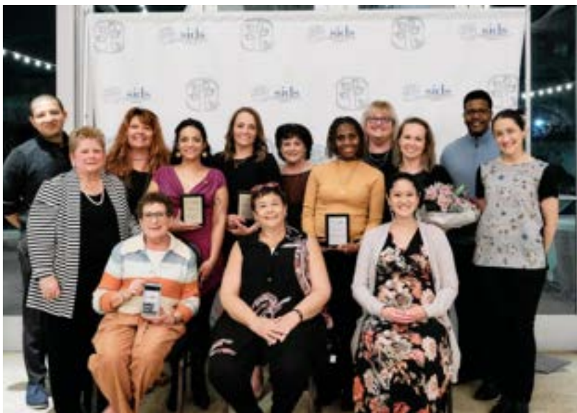
Photo of the SIDS of IL, Inc. team taken at the 2023 Fallen Leaf Fundraiser.

SIDS of IL, Inc. still remains a small family of dedicated professionals. We have 15 dedicated board members, 3 staff members, 3 support assistants, and 5 educators and countless other supporters and volunteers!